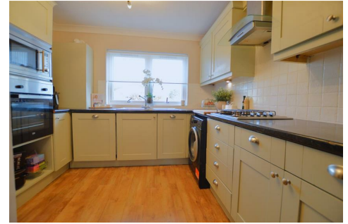
Split Level First Floor